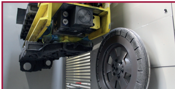
Grinding station with diamond coated wheel

«Engine block» robotic cell with a payload of 1.4 T max.