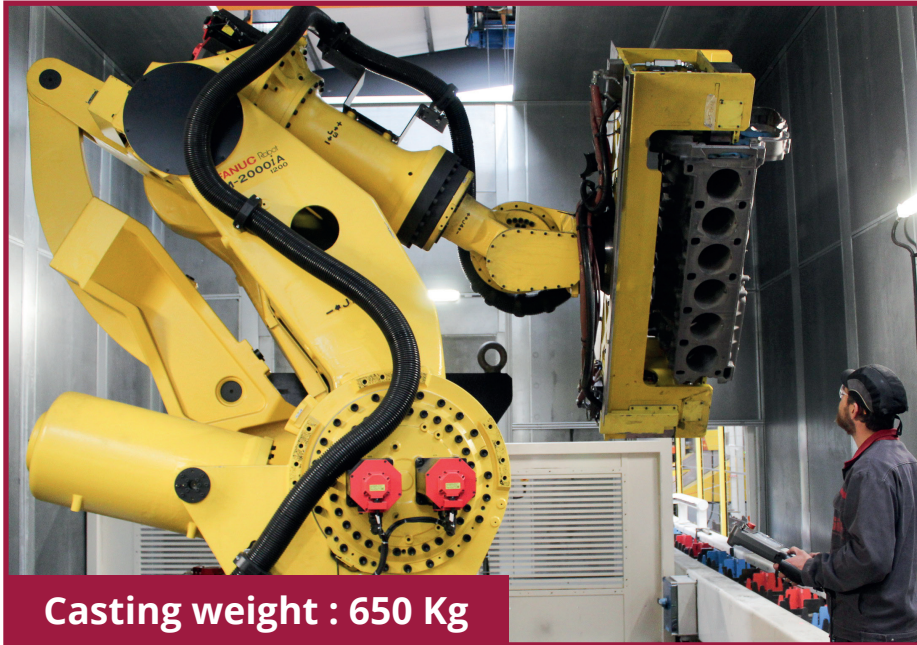
Casting weight : 650 Kg

«Engine block» robotic cell with a payload of 1.4 T max.